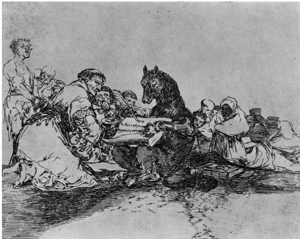
Fig. 3. Francisco José de Goya y Lucientes, This is the worst of it! (Sheet 72. The Disastres of War), 1813 - 1820. Etching and burnishing on ivory wove paper with gilt edges, 179 x 220 mm (plate). Museo del Prado.