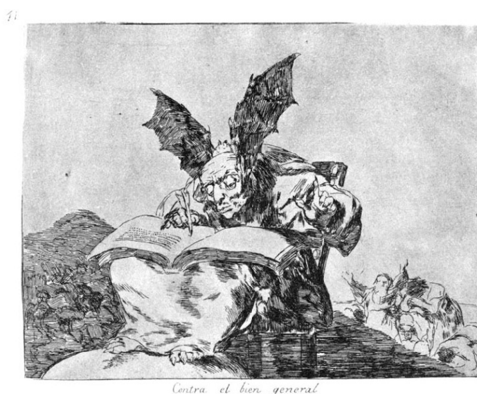
Fig. 1. Francisco José de Goya y Lucientes, Against the common good (Sheet 71. The Disastres of War ), 1813 - 1820. Etching and burnishing on ivory wove paper with gilt edges, 179 x 220 mm (plate). Museo del Prado.

invention of his specific artistic language, which focused on the nature and essence of humankind. Therefore, all the foregoing caused F. Goya's artistic innovation and his special artistic language, which placed the nature and essence of human with its complex organization, to the center of attention, having opened the pure breath of a new era in the "black" engravings.