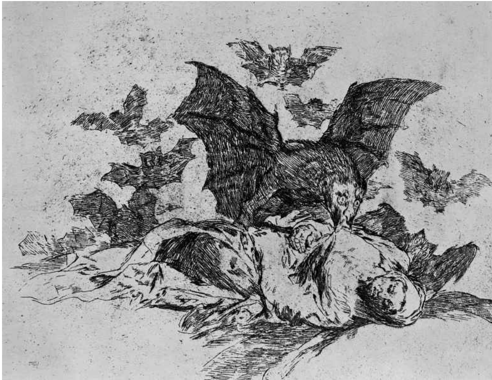
Fig. 2. Francisco José de Goya y Lucientes, Results (Sheet 72. The Disastres of War), 1813 - 1820. Etching and burnishing on ivory wove paper with gilt edges, 179 x 220 mm (plate). Museo del Prado.